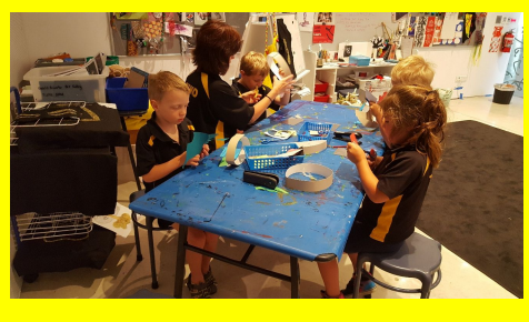
Our Year 1 - 2 students visited Puke Ariki, the Art Gallery and Brooklands Zoo.

Newsletter Sponsors Please support our sponsors on the back page or offer them the opportunity of quoting for your work.