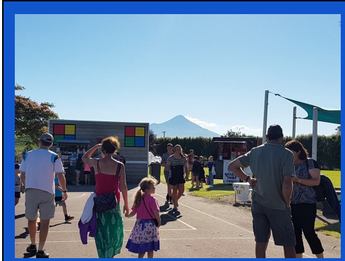
Our Annual Country Fair