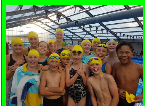
Turnbull Cup Swimmers