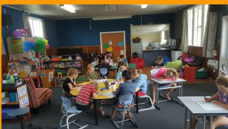
Room 7 in the hall.

Who's who on the staff: Just a reminder about who is working at our school: