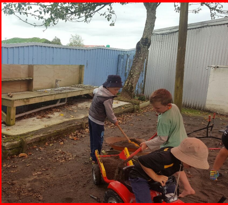
Room 1 visited Toko Play Centre