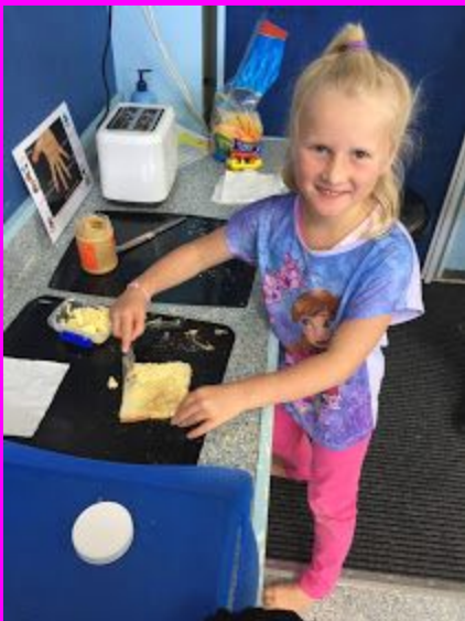
Fraction Toast during Discovery Time.