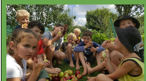
Eating apples from our orchard.